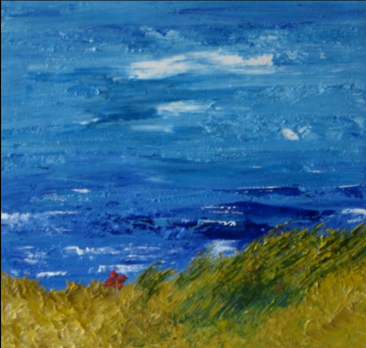
Red Windmill Oil on Board 25 cm x 25 cm

Back cover: "Amongst the Bones", Oil on Canvas, 40 cm x 40 cm (detail)