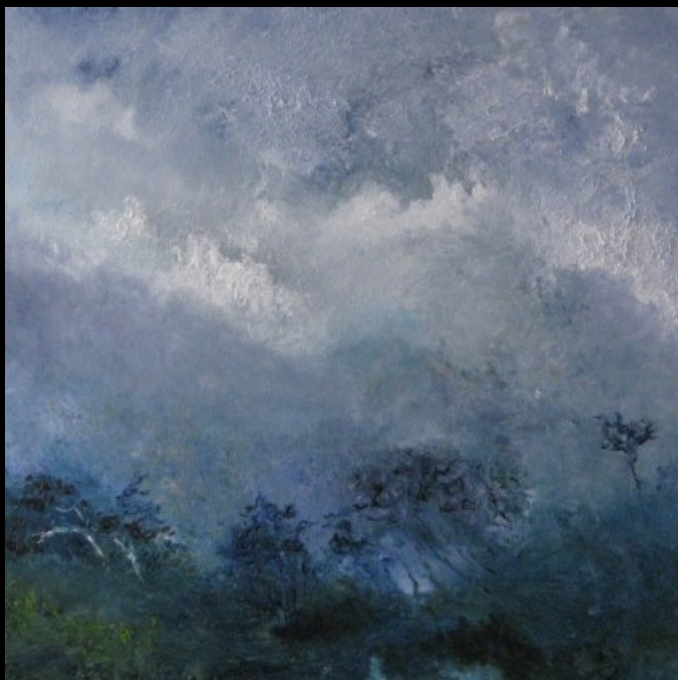
Scratching The Surface Oil on Canvas 50 cm x 50 cm

Front cover: "The Bones of the Place", Oil on Canvas, 50 cm x 50 cm (detail)